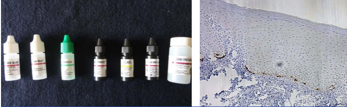
[Table/Fig-3]: HMB-45 immunohistochemical kit (Bio genex). [Table/Fig-4]: HMB-45 immunohistochemical stained slide (10X).